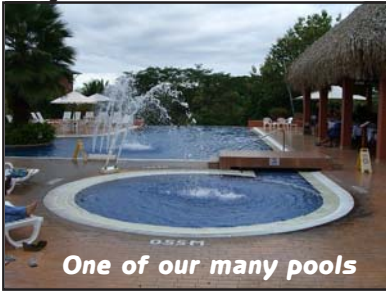
One of our many pools