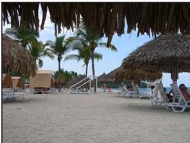
Just "Hangin" at the