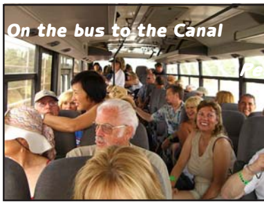
On the bus to the Canal