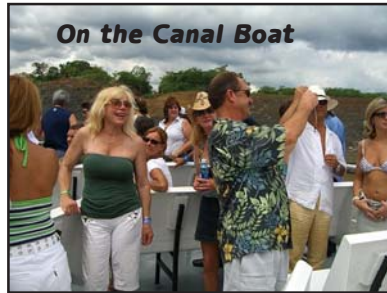
On the Canal Boat