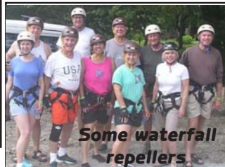
Some waterfall repellers