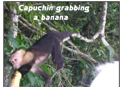
Capuchin grabbing a banana