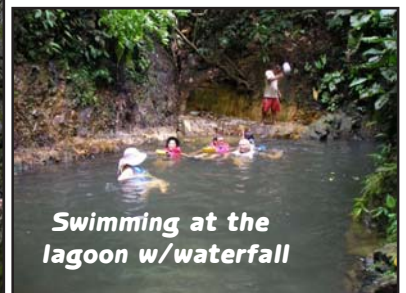
Swimming at the lagoon w/waterfall