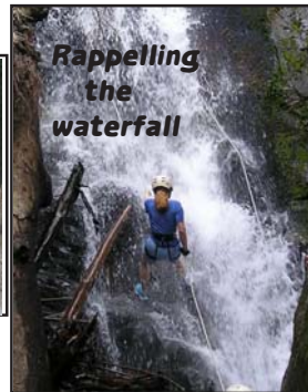
Rappelling the waterfall