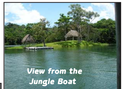
View from the Jungle Boat