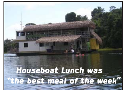
Houseboat Lunch was "the best meal of the week"