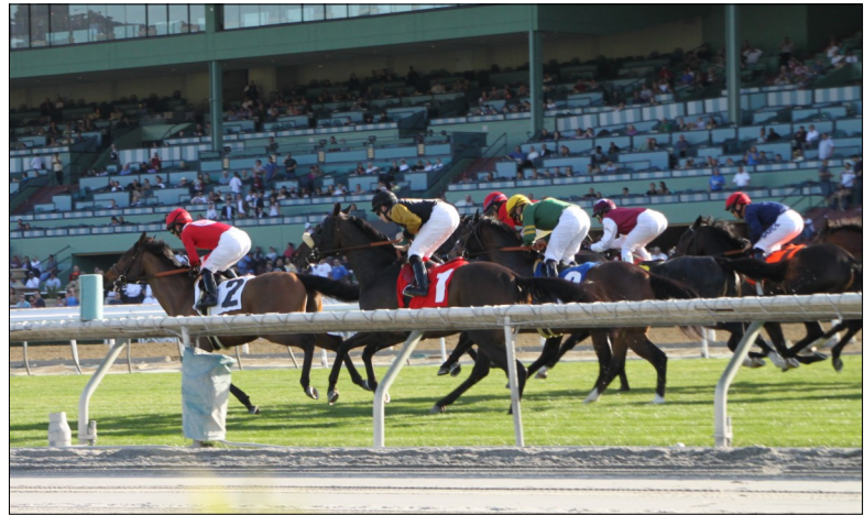
A Day at the Races in Santa Anita- Page 10