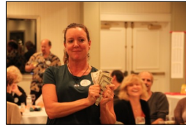
I won !