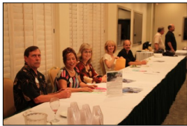
Sign up for various club functions at the Activities table