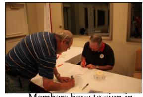
Members have to sign in at every meeting