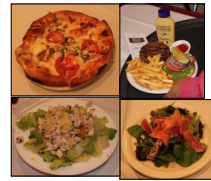
A great selection of dinner options