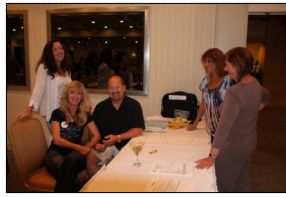
VP Membership surrounded by good looking current members