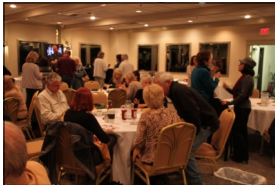
Dinner and good conversation at the meetings