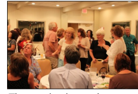
The meeting is over but we continue to visit with friends