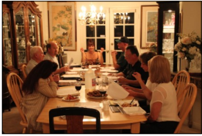
Board meetings on the 2nd Wed. of the month