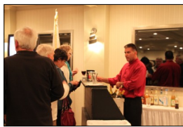
Bar service available at all meetings