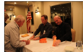
The raffle masters