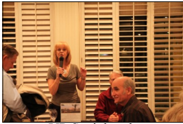
VP Social makes an announcement