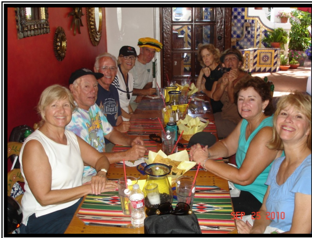
"Campland by the Sea" In San Diego More pics on page 7.