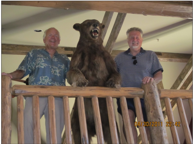
Circle Bar B- see more pix on page 5