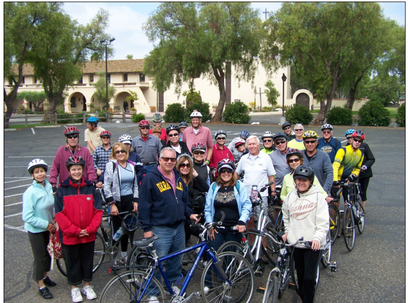
Lake Cachuma Bike Ride. See more pix on p. 7