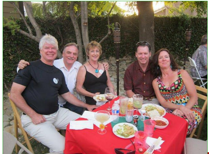
Cinco de Mayo Party (see more pix on page 6)