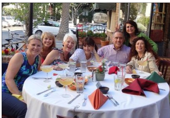
LAKE CACHUMA & A DAY IN PASADENA (see more pix on page 6)