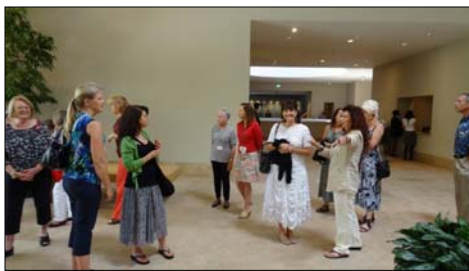
A Day in Pasadena: June 22nd