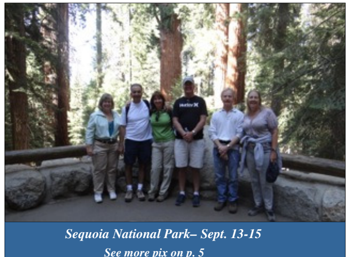
Sequoia National Park– Sept. 13-15 See more pix on p. 5