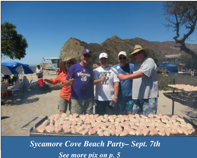
Sycamore Cove Beach Party– Sept. 7th See more pix on p. 5