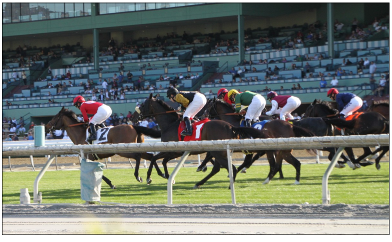
A Day at the Races in Santa Anita- Page 10