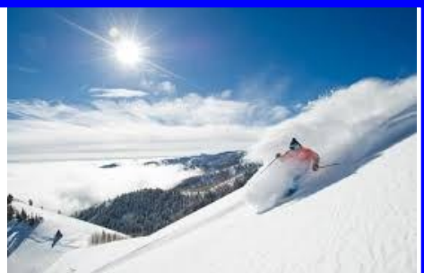
Jan. 31 - Feb. 7, 2015