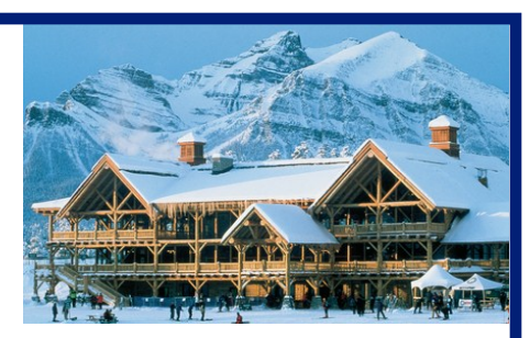
Feb. 28 - Mar. 7, 2015 Banff & Lake Louise Ski Trip