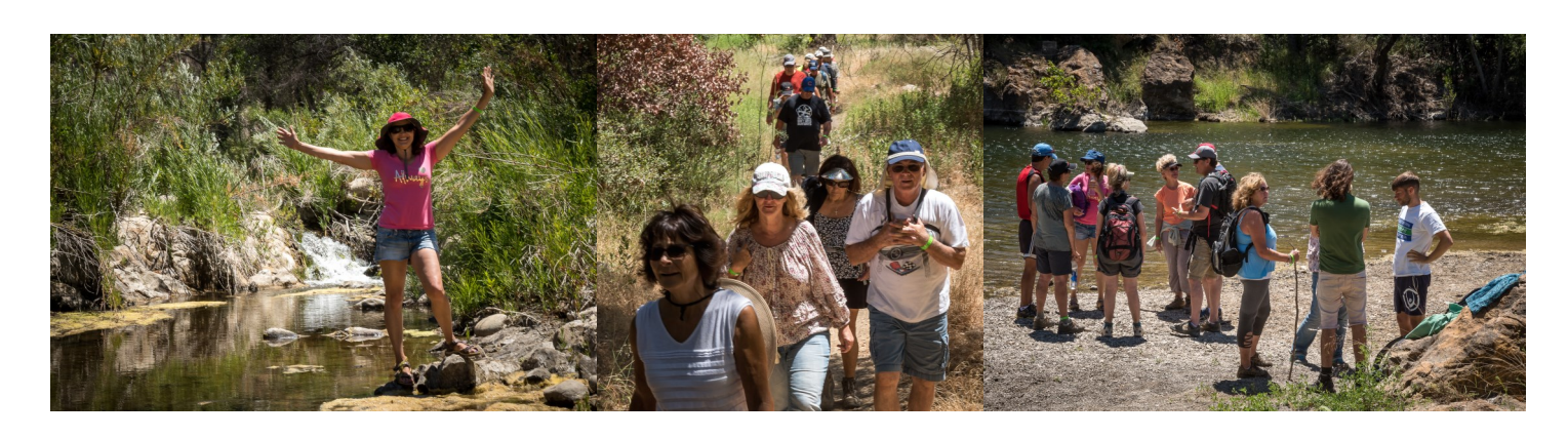
CSSC ANNUAL LAKE CACHUMA CAMPOUT —JUNE 8-11