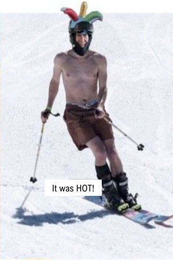
It was HOT!